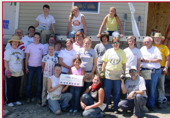
Forest Hills Presbyterian Church of High Point, North Carolina completed the House Raising Challenge in July of 2008.

However, The Challenge is a premium volunteer experience. Some skilled groups may find it more “challenging” and fulfilling than our traditional volunteer program.